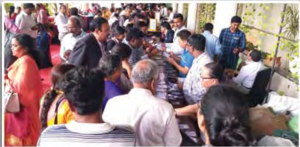
Delegates throngs the registration counter