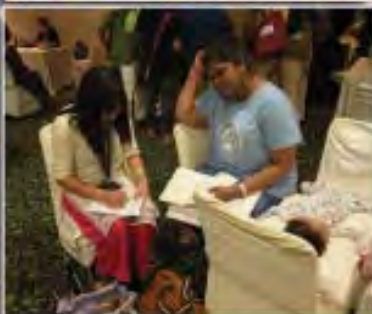
part of the work force behind the scene...