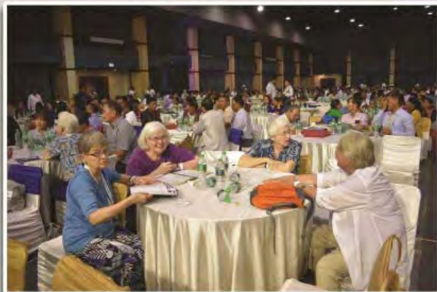
Delegates from abroad