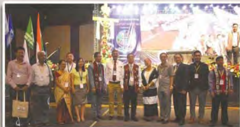
CBCNEI Secretaries and Staff