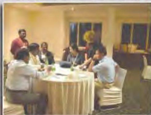
Some serious discussion...