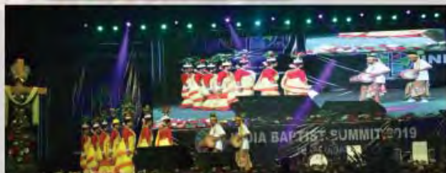
Delegates from Garo Baptist Convention presenting their folk dance