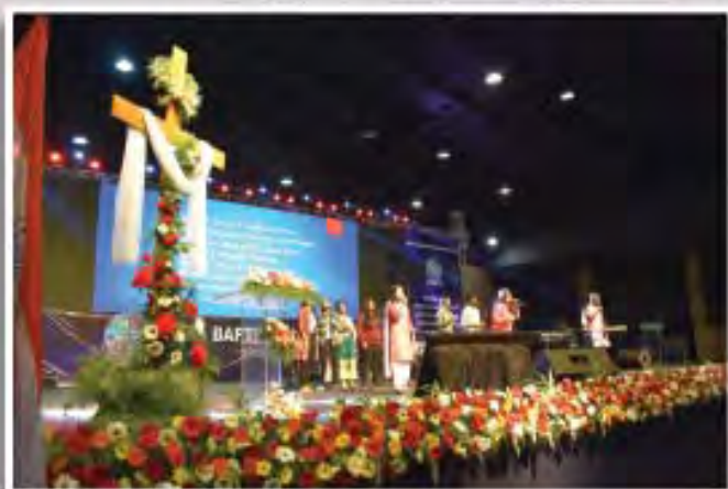
India Baptist Summit Praise and Worship team