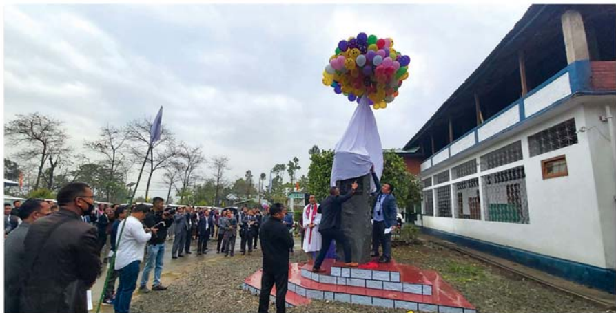
Unveiling of the memorial stone