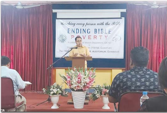
"Ending Bible Poverty," CBCNEI Mission Department in partnership with Youth with a Mission (March 25)