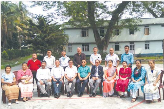
Medical Board Meeting (April 13)