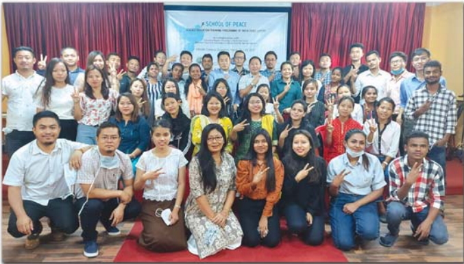
"School of Peace" - A peace education training programme of India Peace Centre with CBCNEI and NCCI (March 23 - 25)