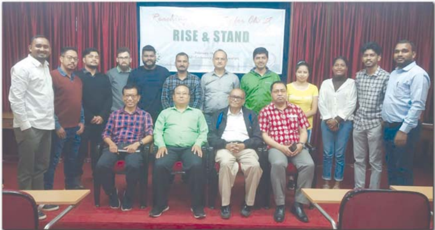
Collaborative effort of CBCNEI Mission Department and Assam Baptist Convention for reaching out along with ministry partners (February 18)