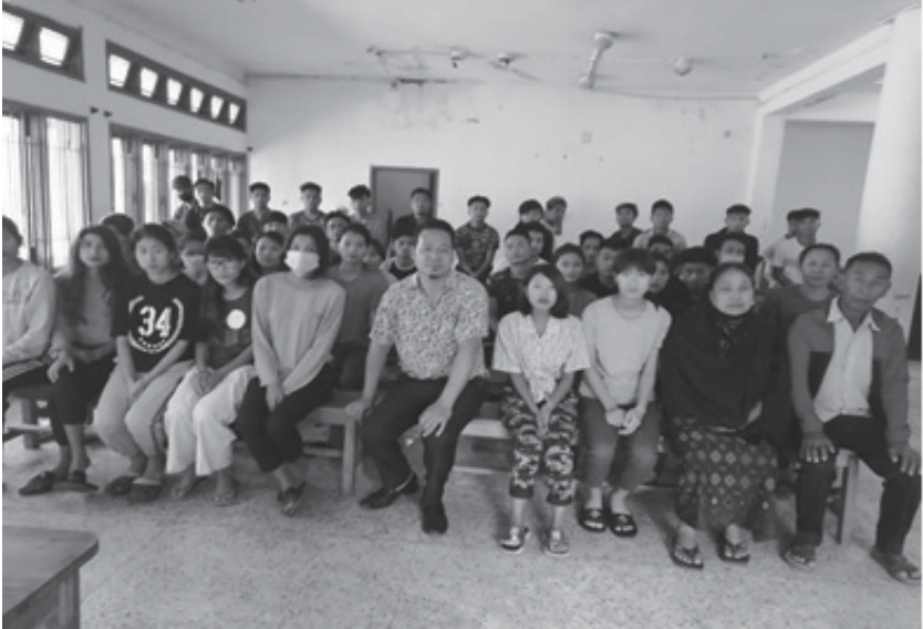
PRAYER FELLOWSHIP WITH INMATES AT QUARANTINE CENTRE